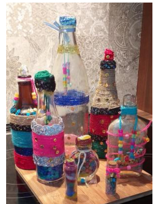
Jay and Riley have been very busy. Their Daddy was using the digger to dig up the garden and they found lots of bottles. The boys washed them and decorated them using lots of colourful thread. We think they look amazing boys. Very well done. Super idea.