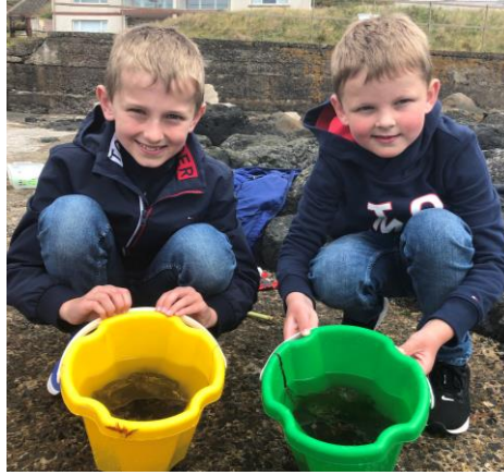
The Shiels boys are at it again but this time they have ventured to Portstewart. The boys have been crab fishing in the rock pools. Fantastic!!